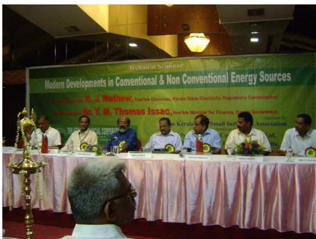
Technical Seminar on Modern Developments in Conventional & Non Conventional Energy Sources on 06.11.2010